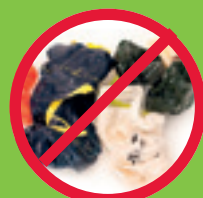
Sacks & carrier bags