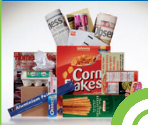
Paper, Magazines, Card, Cardboard