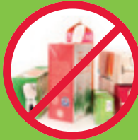
Coated juice & milk cartons